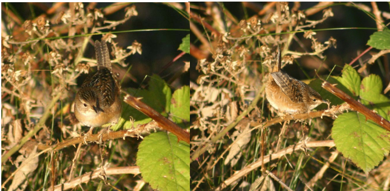
Figures 1 & 2: Record #2: Sedge Wren at Cecile Green Park, Vancouver on October 29, 2005.

The 2 spring records of Sedge Wren fit well into the timing of spring migration which begins in early April and peaks in southern regions by mid-May (Herkert et al. 2001). The shy and retiring nature of Sedge Wrens makes detection of non-singing birds extremely difficult and likely one reason why there are so few records along the entire west coast of North America. This species is a short distance migrant that stays well east of the Rocky Mountains (Herbert et al. 2001). Future records are likely, but will probably occur infrequently. This species can turn up anywhere in British Columbia, including well-known vagrant traps.