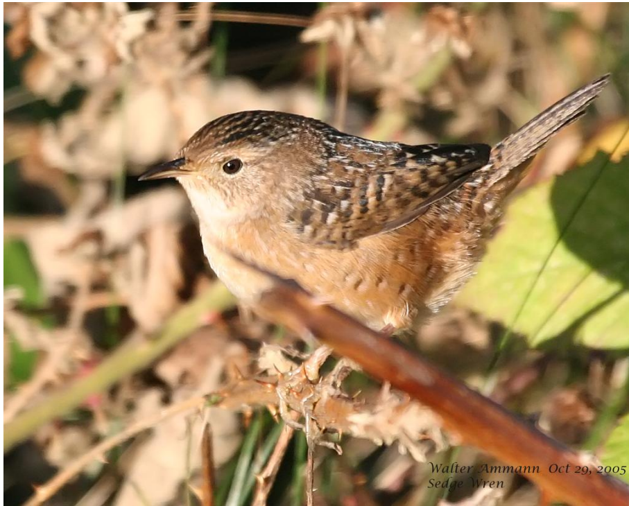
Figure 3: Record #2: Sedge Wren at Cecile Green Park, Vancouver on October 29, 2005. Photo © Walter Ammann.