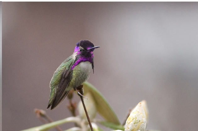
Figure 3 & 4: Costa's Hummingbird adult male at 35 th and Camosun Street, Point Grey, Vancouver on January 22, 2011.