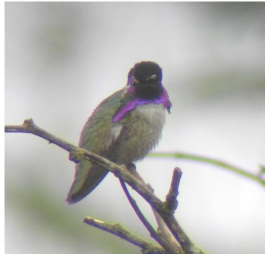
Figure 1 & 2: Costa's Hummingbird adult male at Jordan River on April 7, 2007.