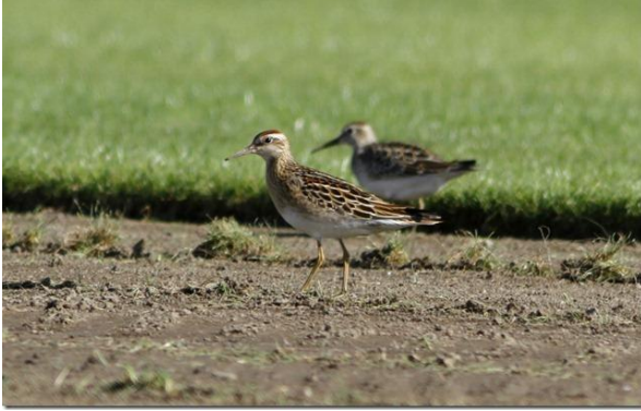
Sharp-tailed Sandpiper juvenile September 11, 2012 at the Campbell Road Turf Farm, East Abbotsford.