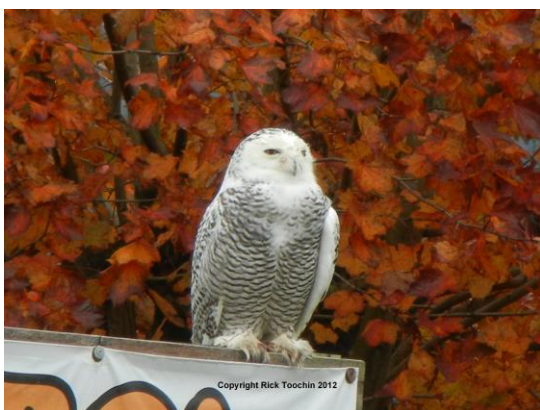
Snowy Owl in Chilliwack on November 4, 2012: Photo © Rick Toochin.

Brooks had a few sightings of these over many winters in the 1880s but states it is very rare (Brooks 1917).