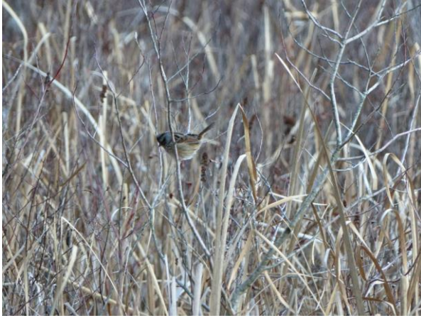
Swamp Sparrow adult along Union Bar Road at Thacker Marsh in Hope on November 24, 2013.