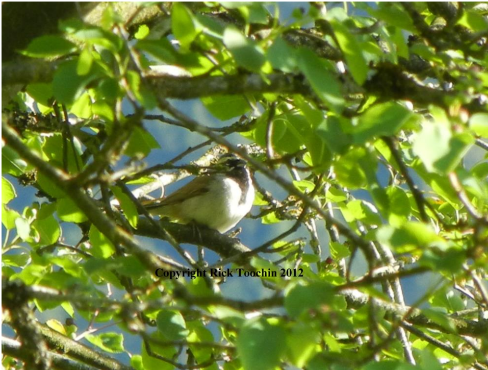
Black-throated Sparrow in a yard at Hope Airport on June 11, 2012.

1.(1) adult March 3, 2013: Corina Isaac, Rick Toochin (FN) Columbia Valley Road (Toochin 2013i)