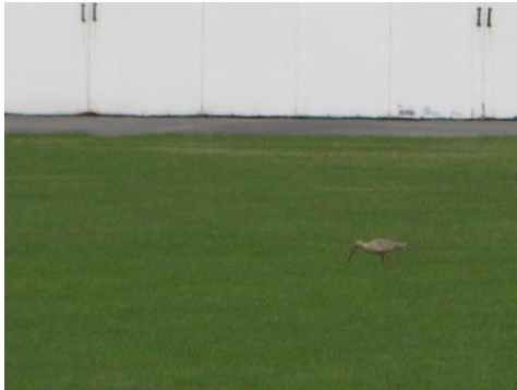
Long-billed Curlew at Hope Airport on April 14, 2011.