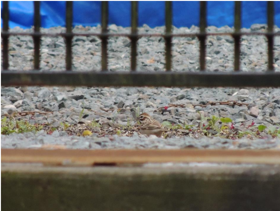
Lark Sparrow at Green Point along Harrison Lake on June 1, 2013.