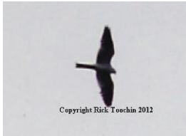
White-tailed Kite at Chilliwack on April 26, 2012.