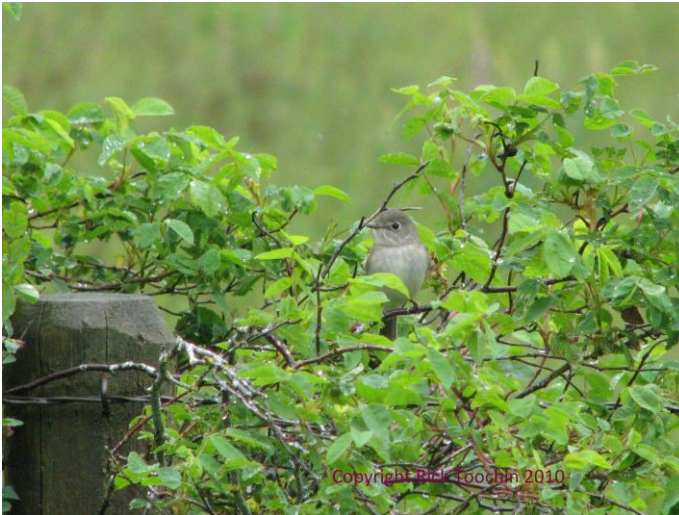
Gray Flycatcher at Hope Airport on May 29, 2010.