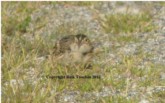
Grasshopper Sparrow at Hope Airport on May 24, 2012.