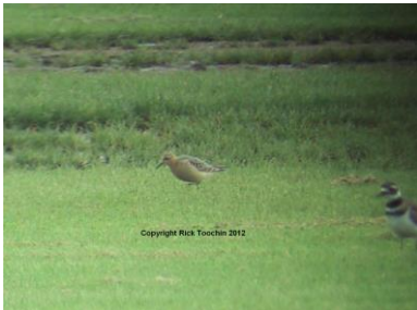
Buff-breasted Sandpiper juvenile September 8, 2012 in Sumas Prairie.