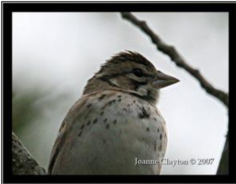
Lark Sparrow at the Great Blue Heron Reserve on September 2, 2007.