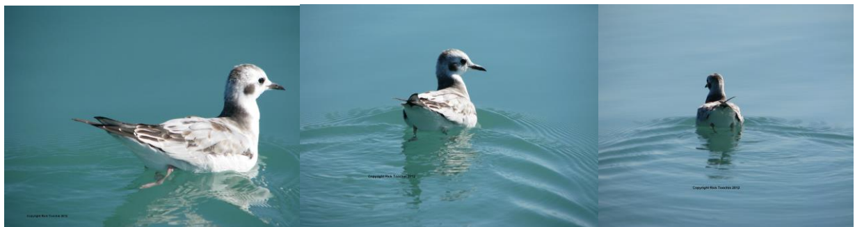
Little Gull juvenile in transition to 1 st winter September 15, 2012 at Harrison Lake.

Birds of BC shows an occurrence of this species in Summer for Harrison Lake but gives no details (Campbell et al. 1990b).