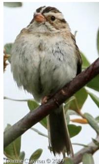
Clay-colored Sparrow at the Great Blue Heron Reserve on July 8, 2009. 2 views of same bird.