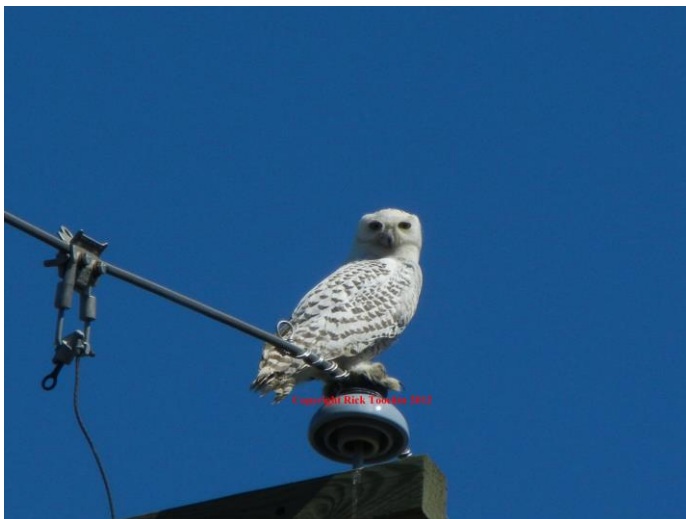
Snowy Owl in Chilliwack on April 7, 2012.