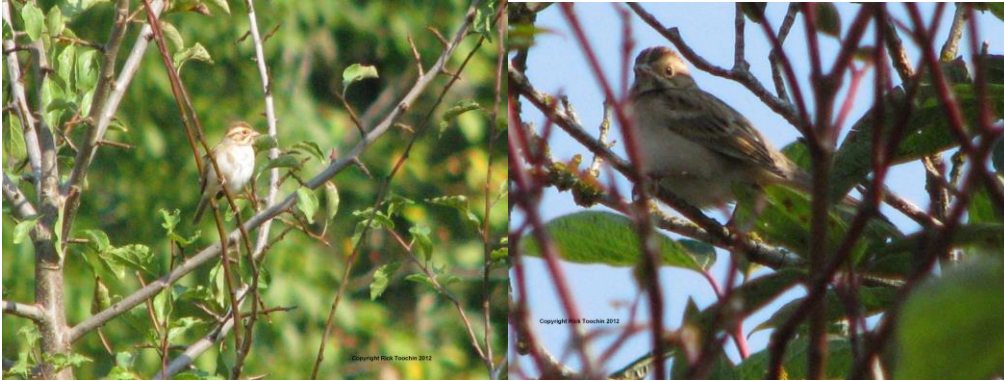
Clay-colored Sparrow immature at Hope Airport on September 23, 2012.