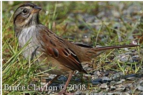
Swamp Sparrow adult at the Great Blue Heron Nature Reserve in Chilliwack on October 10, 2008.