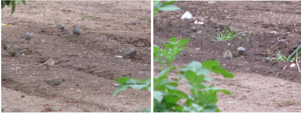
Clay-colored Sparrow immature at Hope Airport on September 22, 2012.