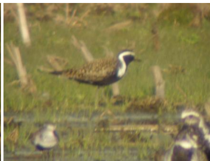
American Golden Plover at Chilliwack on May 7, 2010. 2 views of the same bird.