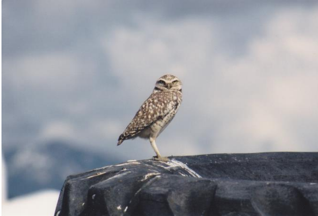
Burrowing Owl in Chilliwack on April 5, 2003.

Brooks mentions that this was a hard to find local resident (Brooks 1917).