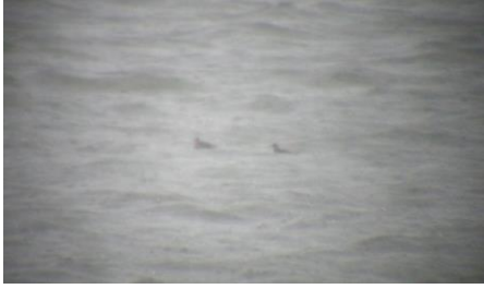
Red Phalarope adults September 10, 2012 at Harrison Lake.