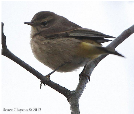
Palm Warbler at the Great Blue Heron Reserve on November 19, 2013.