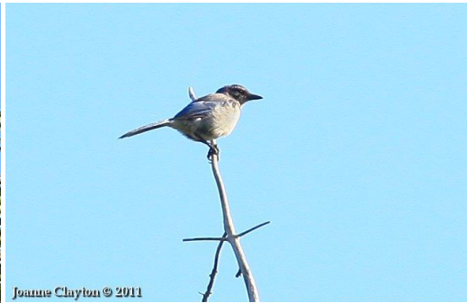
Western Scrub-Jay at the Great Blue Heron Reserve on August 1, 2011. 2 views of the same bird.

Brooks observed that this species was rare in the winter but didn't breed in the Upper Fraser Valley (Brooks 1917).