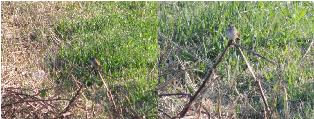
Swamp Sparrow adult along Cole Road in Sumas Prairie in Abbotsford on November 24, 2013.