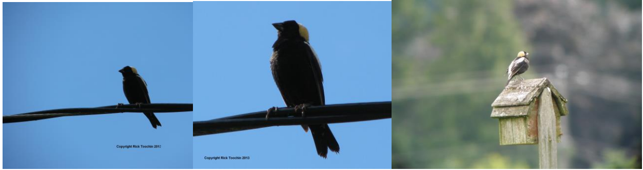
Bobolink adult male May 30, 2013 at Jack Delair's yard at Hope Airport. 3 views of same bird.