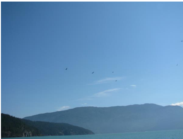
Parasitic Jaeger adults September 15, 2012 off Echo Island (same picture as above).