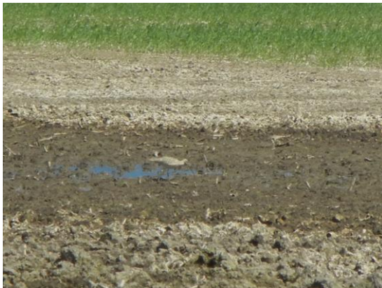
Long-billed Curlew in Chilliwack on May 6, 2012.