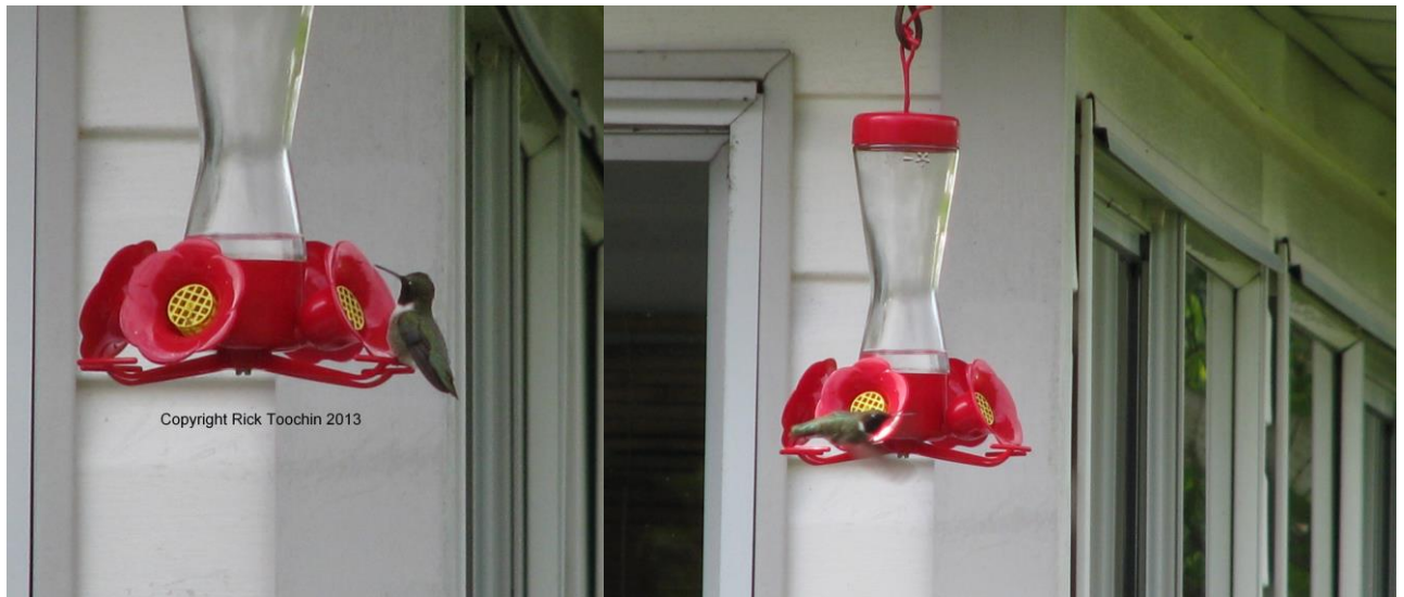
Black-chinned Hummingbird adult male (1 of 3) May 17, 2013 at Hope Airport.