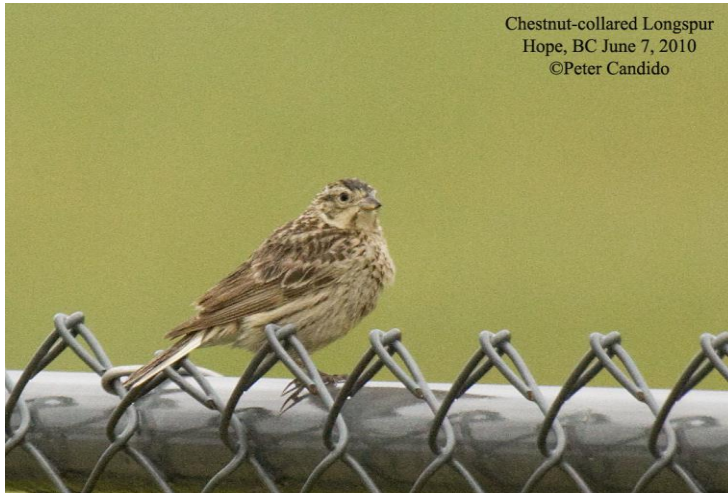
Chestnut-collared Longspur Hope, BC June 7, 2010

Chestnut-collared Longspur at Hope Airport on June 7, 2010.