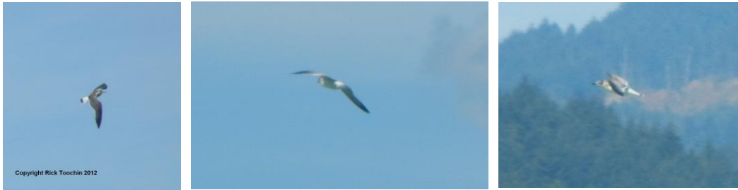
Franklin's Gull immature September 5, 2012 at Harrison Lake.