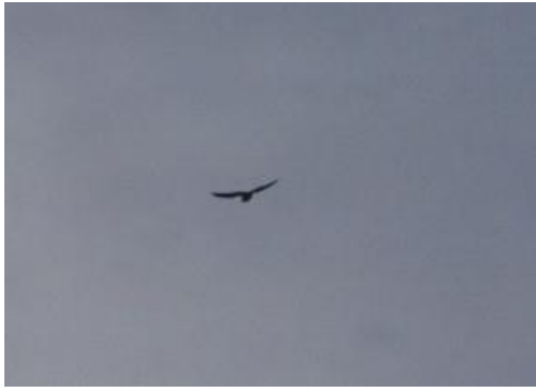
White-tailed Kite at Chilliwack on April 17, 2011.