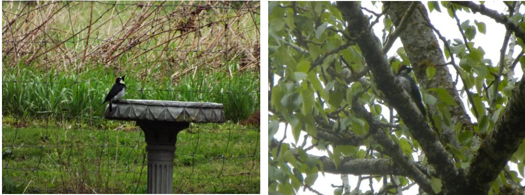
Acorn Woodpecker in Sunshine Valley outside Hope on May 20, 2011.

Black-backed Woodpecker ( Picoides arcticus ) : [Accidental in the Summer and Fall: Sight Records: However likely more regular than records indicate: could easily breed sporadically in north and eastern area of checklist area in appropriate habitat and elevation]