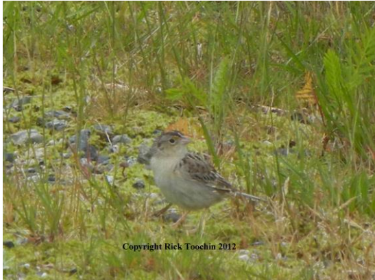
Grasshopper Sparrow at Hope Airport on May 23, 2012. Photo © Rick Toochin.