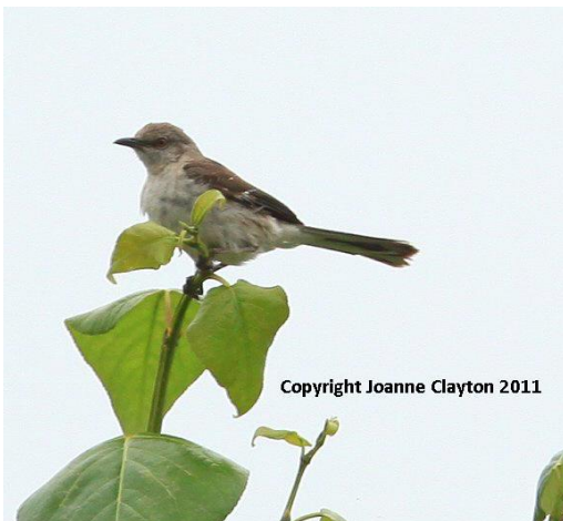
Northern Mockingbird in Chilliwack on July 20, 2011.