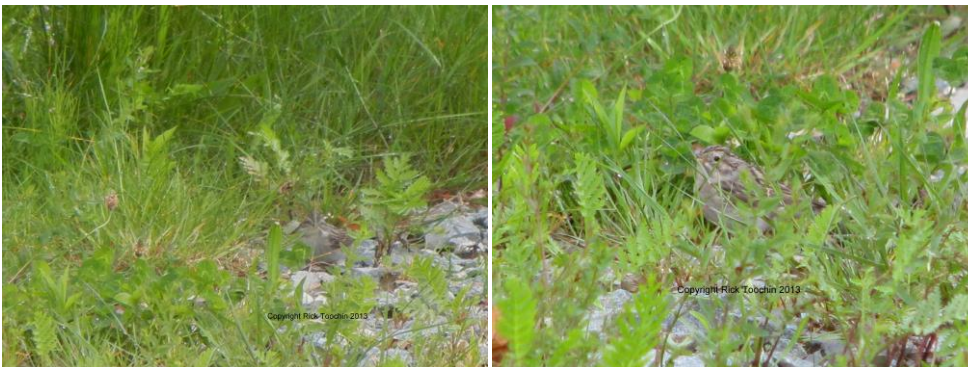
Brewer's Sparrow adult May 30, 2013 at Hope Airport.