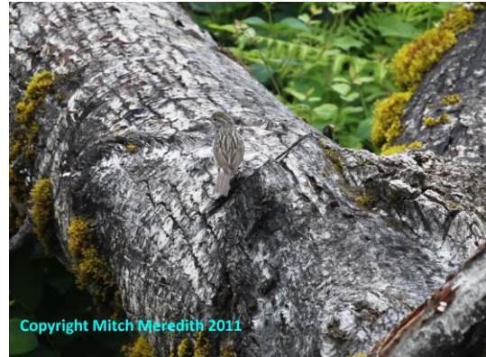
Brewer's Sparrow at Hope Airport on June 15, 2011. (left image). Brewer's Sparrow at Hope Airport on June 15, 2011. (right image).