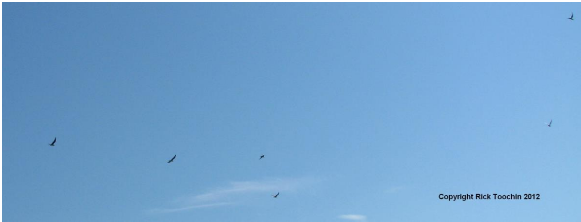
Parasitic Jaeger adults September 15, 2012 near Echo Island over Harrison Lake (6 of 8 birds!).