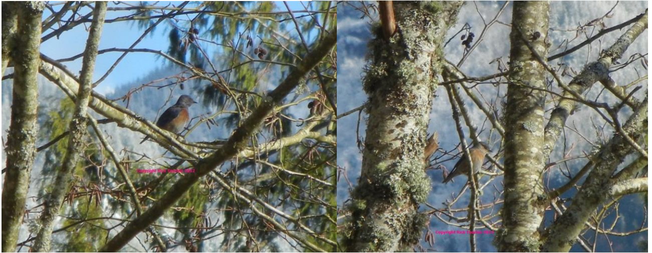
Western Bluebirds adult male and female (part of group of 4) March 3, 2013 at Columbia Valley.