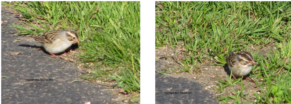
Clay-colored Sparrow adults at Hope Airport on May 31, 2013 [1 of 3 birds present].