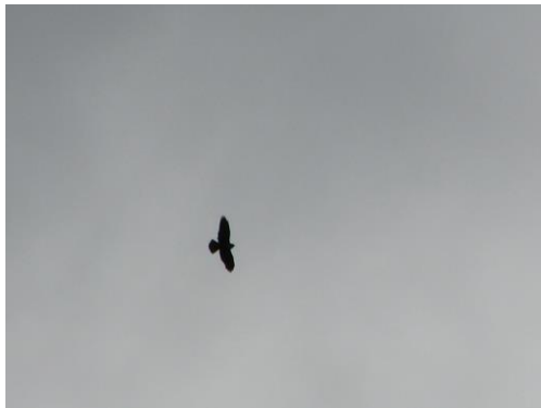
Swainson's Hawk at Hope Airport on June 12, 2013.