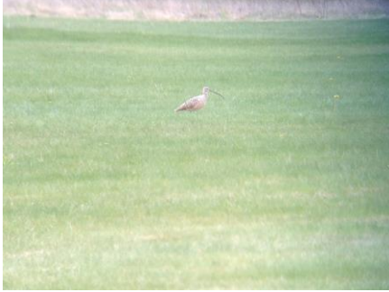
Long-billed Curlew at Hope Airport on April 15, 2013.