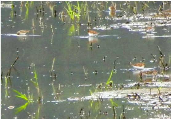
Little Stint adult in breeding plumage in Chilliwack on May 4, 2011.