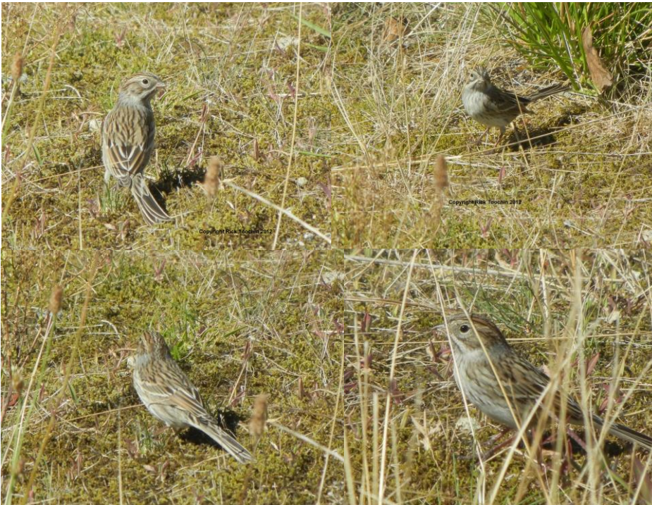
Brewer's Sparrow immature September 12, 2012 at Harrison Lagoon.