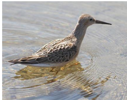
Stilt Sandpiper juvenile August 15, 2010 at Harrison Lagoon.