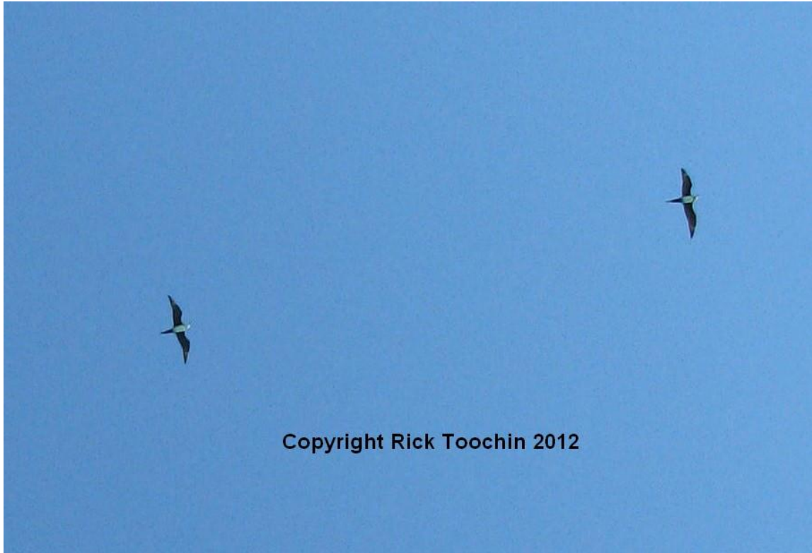
Parasitic Jaeger adults September 15, 2012 at Harrison Lake (2 of 8 birds seen!).

Brooks saw several of this species over a few Septembers but only gives details for 1 record (Brooks 1917).