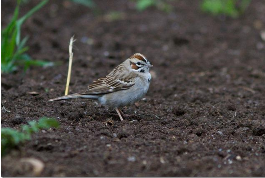
Lark Sparrow at Hope Airport on June 9, 2012.