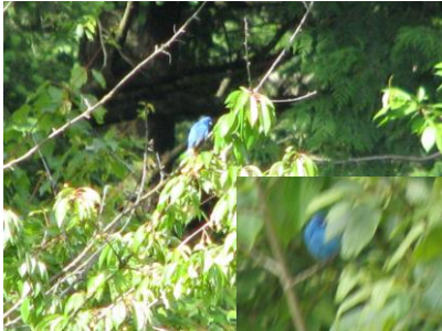
Indigo Bunting adult male May 30, 2013 at Hope Airport.