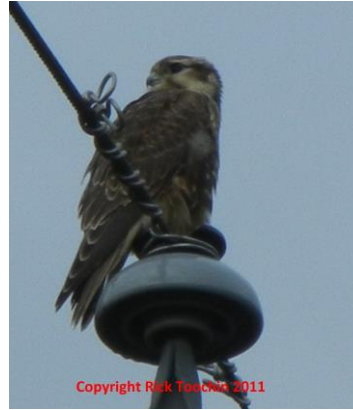
Prairie Falcon at Chilliwack on July 16, 2011.