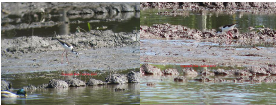
Black-necked Stilts at Chilliwack on May 7, 2013. 2 views of same bird.