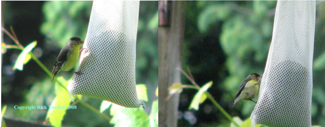
Lesser Goldfinch at Abbotsford on June 14, 2008. 2 views both.