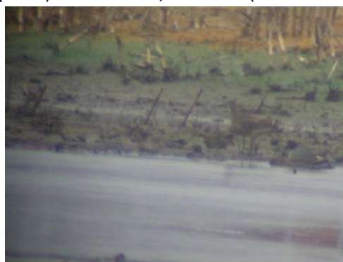
Figure 1 & 2: Record #4: 2 Whimbrels on May 12, 2013 at Banford Road, Chilliwack.