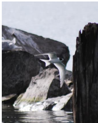
Arctic Tern juvenile on Harrison Lake on September 13, 2010.