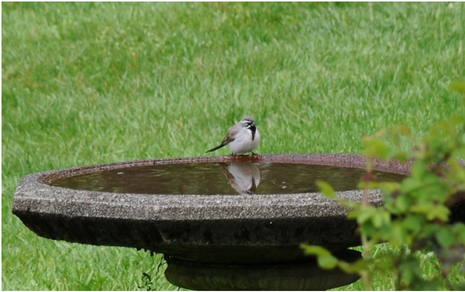
Black-throated Sparrow in a yard along Front Street in Yale on May 27, 2012.

6.(1) adult May 12, 2013: Rick Toochin (FN) Hope Airport (Toochin 2013h)