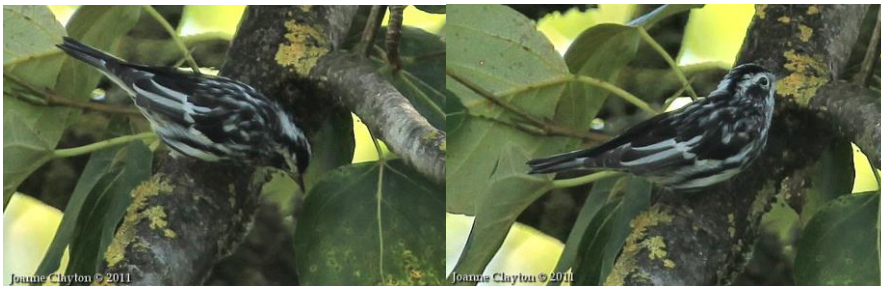
Black and White Warbler at the Great Blue Heron Reserve on August 12, 2011. 2 views of the same bird.