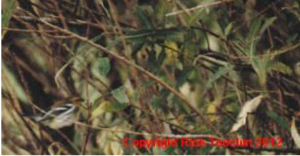
Black-throated Green Warbler at Hope Airport on September 26, 2012. Photo © Rick Toochin.

1.(1) immature September 26 & October 1, 2012: Rick Toochin (photo) Hope Airport (Toochin 2013j)