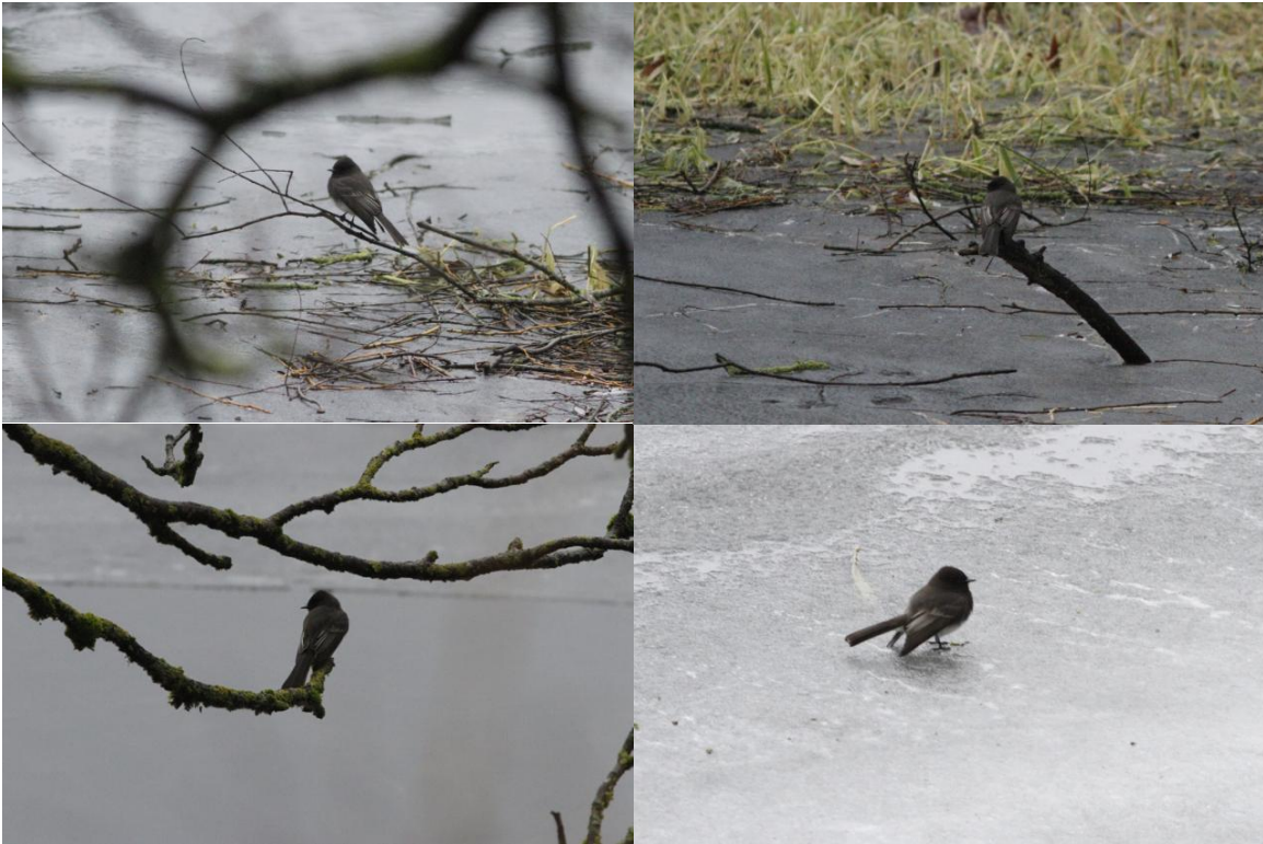
Black Phoebe at Chilliwack on December 14, 2013.

4.(1) adult December 14-15, 2013: Dave Beeke, mobs (photo) Kitchen Hall Road, Chilliwack (D. Beeke Pers.Comm.)