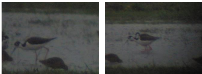
Black-necked Stilts at Chilliwack on May 16, 2011. 2 views both birds.