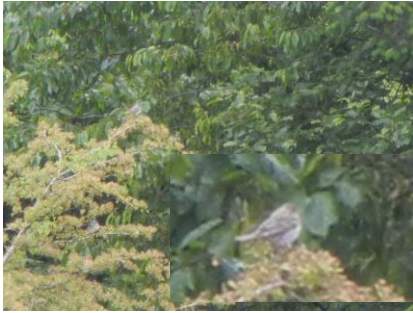
Indigo Bunting adult female May 28, 2013 at Hope Airport.