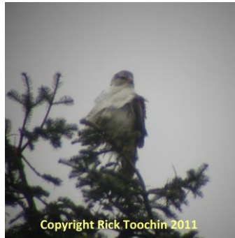
Ferruginous Hawk adult light phase April 15, 2011 at the corner of Gibson Road and Chilliwack Central Road in Chilliwack.

Records in Birds of BC for the Spring/Fall but no supporting details given (Campbell et al. 1990b).