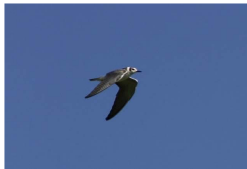
Black Tern juvenile in Sumas Prairie, East Abbotsford on September 7, 2013.