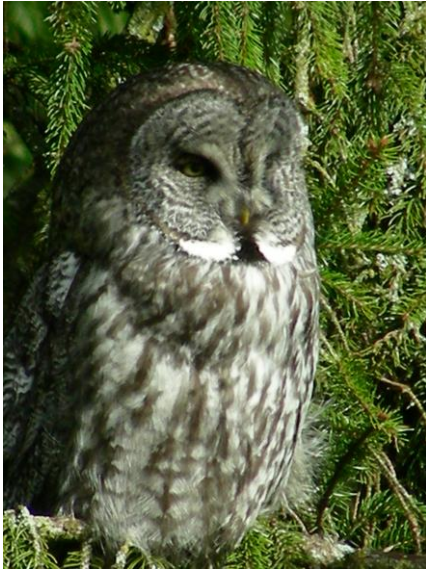
Great Gray Owl in Mission on March 20, 2011.