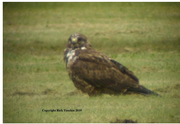
Swainson's Hawk at Hope Airport on May 29, 2010.