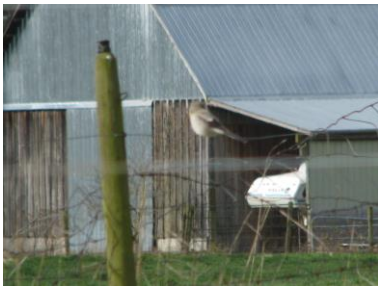
Loggerhead Shrike adult March 21, 2013 in the Columbia Valley.