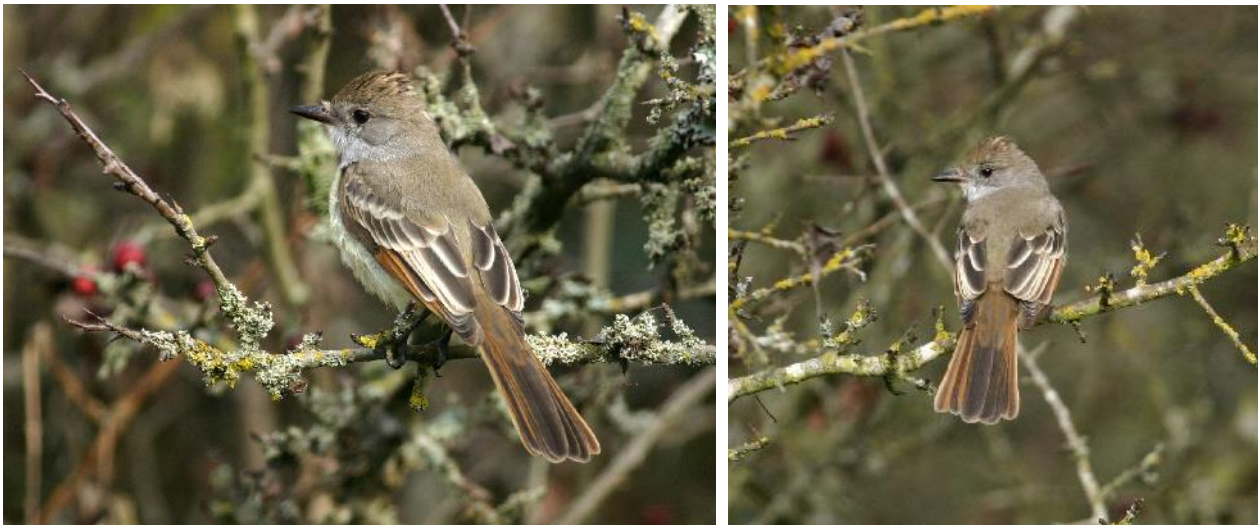
Figures 2 & 3: Record #63: Ash-throated Flycatcher along 72 nd Street, Delta on November 6, 2004.