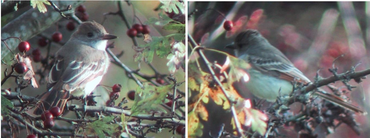
Figure 1: Record #63: Ash-throated Flycatcher along 72 nd Street, Delta on October 22, 2004.