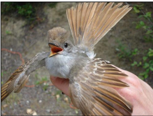
Figure 4: Record #72: Ash-throated Flycatcher at Mugaha Marsh Banding Station, Mackenzie on August 26, 2008.