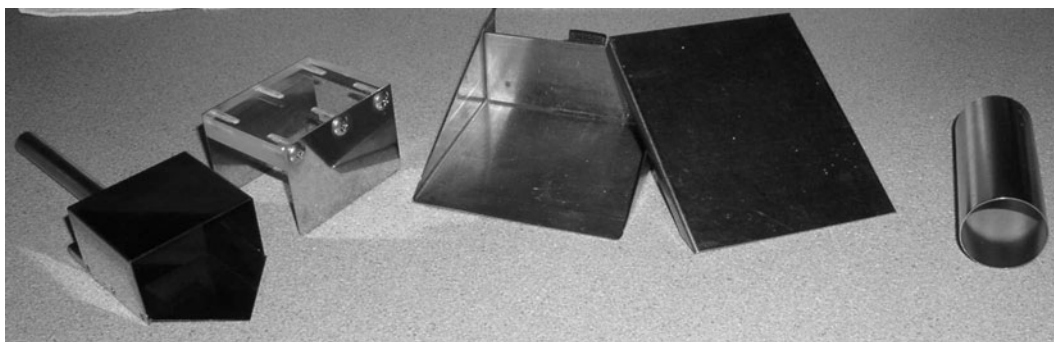
Fig. 1. Various types of density cutters tested for variance. Left to right: box (Hydro-Tech 100 cm 3 ), wedge (Snow Research Associates 200 cm 3 ) and tube (Wasatch Touring 100 cm 3 ).

type or rip cutter design is attributed to R.I. Perla and is presently manufactured by Snowmetrics in the USA. The wedge-type cutter tested was made by Snow Research Associates (SRA) and is no longer available (Fig. 1, middle). The Wasatch Touring density kit with a small, 100 cm 3 tube-type cutter (Fig. 1, right) was designed by S. Rosso and can be obtained through numerous sources worldwide. Specifications of the cutters are summarized in Table 1.