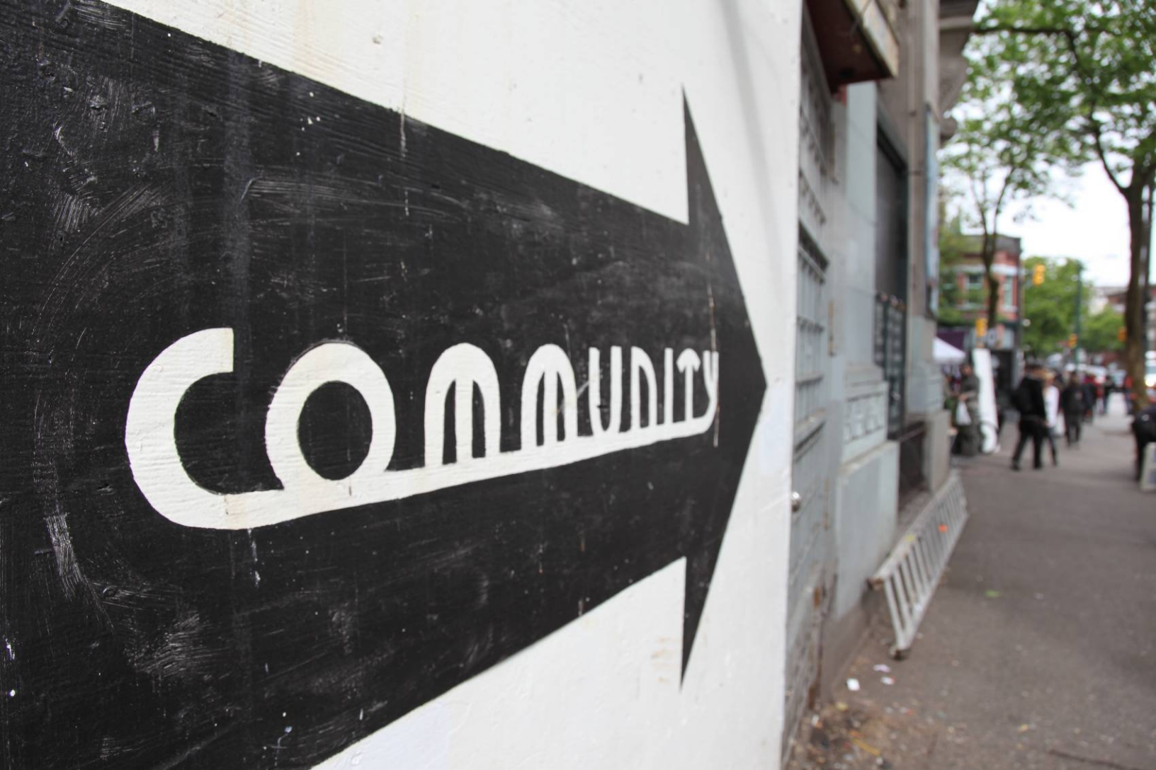
Community in the City. Above: West Hastings Street, June 2012. Below: Vancouver, CIBC Run for A Cure. Concord Pacific, "Building Communities Together." October 2010.