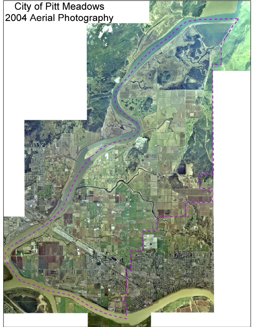
City of Pitt Meadows 2004 Aerial Photography