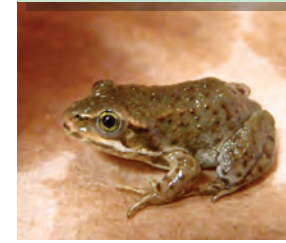
Oregon Spotted Frog

Generally sits crouched. Dorso-lateral folds vague on lower back.