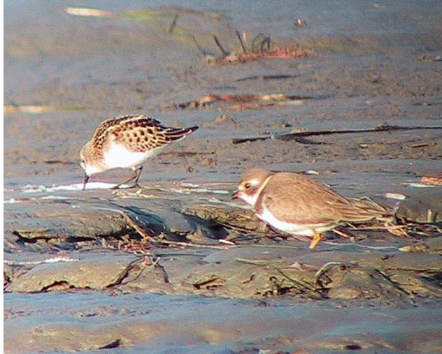
Little Stint juvenile September 21, 2005 near 96 th St., Boundary Bay.