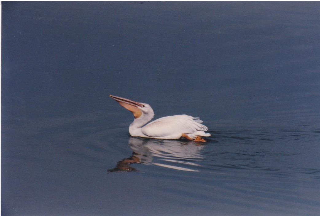
American White Pelican September 3, 1999 at the Outer Pond of Iona Island, Richmond.

Horned Lark* Mountain Chickadee House Wren* Mountain Bluebird* Northern Mockingbird Bohemian Waxwing Northern Waterthrush Black and White Warbler Nashville Warbler American Redstart* Palm Warbler American Tree Sparrow Chipping Sparrow* Clay-colored Sparrow Vesper Sparrow* Swamp Sparrow Harris' Sparrow Lazuli Bunting* Rusty Blackbird Gray-crowned Rosy-Finch Pine Grosbeak White-winged Crossbill Common Redpoll