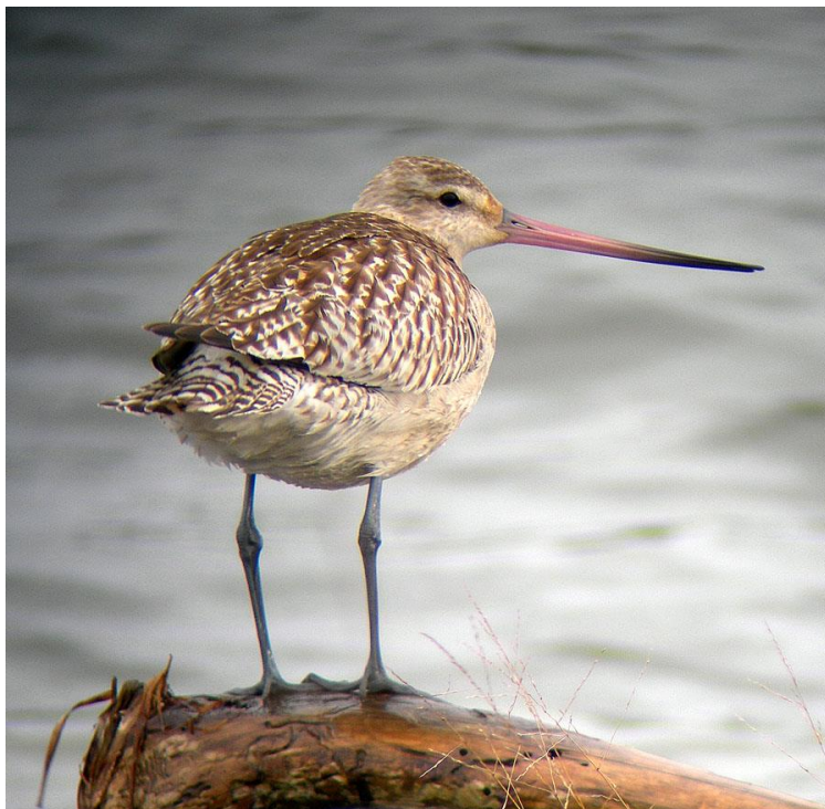
Bar-tailed Godwit juvenile November 10, 2005 at Blackie Spit.