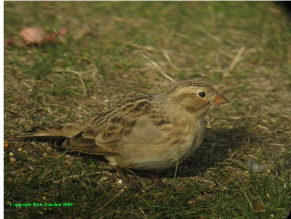
McCown's Longspur juvenile October 11, 2009 at Stanley Park, Vancouver.